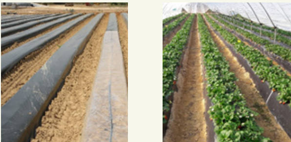
Fig. 1: Strawberry field trial during biosolarisation and subsequent (healthy) crop. Author: B. De Los Santos.

For strawberry crops, several materials have been tested in different countries, showing promising results when applying biosolarisation with available fresh poultry manure (FPM) to control fungi and nematodes (López-Aranda et al., 2012; Zavata et al., 2014) (fig.1).