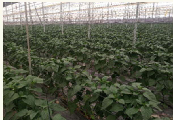
Fig. 3: Healthy pepper crop after biosolarisation of soil with Meloidogyne spp. Author: J. I. Marín.

Results of this long period of trials show that biosolarisation is the best alternative to control Phytophthora capsici and P. parasitica as well as Meloidogyne incognita (Martínez et al., 2006; Ros et al., 2008). Also soil fatigue was reduced when biosolarisation was conducted. The biosolarisation was performed in these trials using the following approach. Easily available fresh sheep manure (FSM) was mixed with fresh pepper residues and/or FPM. The dosage of organic matter was reduced as the treatment is repeated year after year: FSM+FPM: 5+2.5 kg/m 2 (1st year), 4+2 (2nd year), 3+1.5 (3rd year), 2+0.5 (4th and later years) (Martínez et al., 2011). In these studies, the biosolarisation is highly effective when applied in Summer (fig.2).