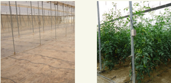
Fig. 3: Tomato field trial during biosolarisation and subsequent (healthy) crop. Author: J. I. Marín.

some diseases that have been controlled by means of incorporating fresh organic matter (mostly a mix of plant-crop residues and fresh manure) followed by a deep irrigation and tarping with transparent polyethylene or Virtually impermeable film (VIF). Some growers sow mustard and other Brassicas on their own farms to mix with fresh manure and/or crop residues, and in many cases the biosolarisation is performed only on the plantation rows (cropping areas), which reduces the consumption of plastic and organic matter (LINK to Videos Biofumigation) (Martín-Expósito et al., 2013; García-Raya et al., 2019; Gómez-Tenorio et al., 2018) (fig. 3).