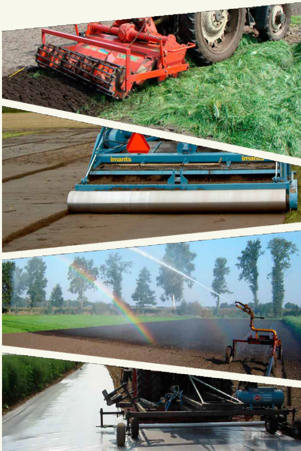
Fig. 1: Anaerobic Soil Disinfestation in a glance (from top to bottom): Incorporation fresh organic matter Closing the surface Wetting the soil Covering with virtually impermeable film (VIF)

The Best4Soil video Anaerobic Soil Disinfestation: Practical information (link##) shows the principle of anaerobic soil disinfestation (ASD). ASD is an alternative for chemical soil disinfestation. Figure 2 gives an overview of the steps to take for successful application of ASD (at the top) and their effect (at the bottom).