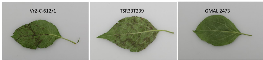
Fig. 2 Inoculation results of the Vr2-C transgenic line 612/1, TSR33T239, and GMAL 2473 with the scab isolate 1634 28 dpi. Vr2-C-612/1 and TSR33T239 show strong apple scab sporulation while GMAL 2473 did not show any symptoms

Vr2-C transgenic lines losing their resistance when inoculated with isolates overcoming Rvi4 resistance, the identification of ‘Russian Seedling’ (source of Rvi4 ) in the pedigree of GMAL 2473, and the demonstrated inheritance of haplotypes containing Rvi4 in both ‘Russian Seedling’ and GMAL 2473.