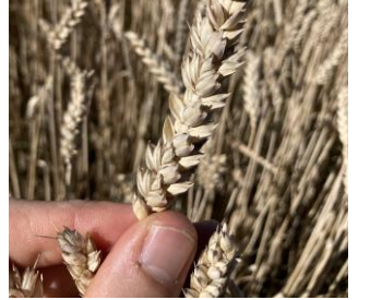
Figure 2: Damaged ear (wheat)