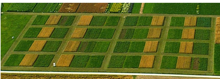
Figure 1 DOK long term farming system comparison trial. The experimental design consists of eight different farming systems and fertilization intensities (half = 1; full = 2). Organic systems are characterized by fertilization through slightly (BIOORG) and fully (BIODYN) aerobically composted farmyard manure and slurry, and mechanical weed control. Conventional systems combine manure and mineral fertilization (CONFYM) and a system with only mineral fertilization (CONMIN2), and received chemical plant protection.

We defined yield stability as the probability that the yield of the farming system i falls below the 70 th percentile of the mean of a reference yield (here CONMIN2). This production risk assessment can be interpreted as the certainty (or risk) with which agronomists or farmer can predict the yield amount of their cropping systems. To assess crop-specific drought influences on yield, we first subset the monthly calculated climate variables per crop using only month during the average historical growing seasons. The resulting variables were then subjected to a principle component analysis to reduce multicollinearity. The principal component 1 was then used as a crop-specific drought indicator.