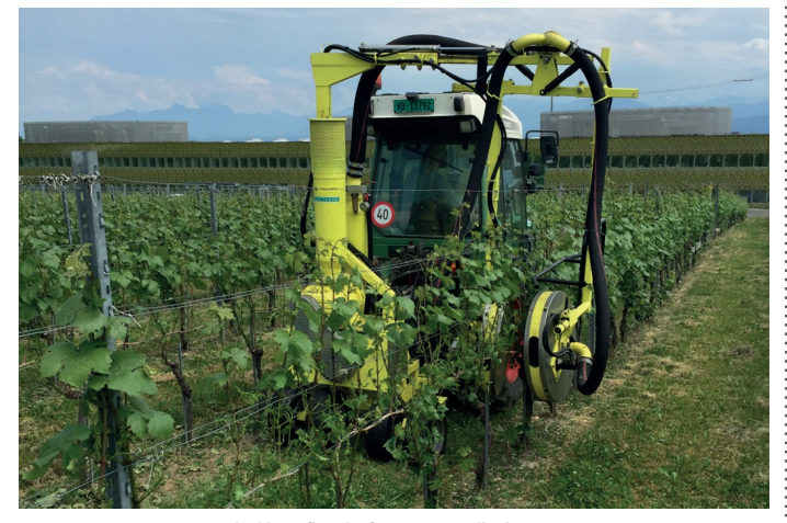
FIGURE 1. Low-pressure double airflow leaf remover (Collard, Bouzy, France) in action at preflowering stage (speed 0.6 km/h). Cultivar Gamay, Nyon, Switzerland.

The trial was conducted from 2016 to 2020 in the experimental vineyards of Agroscope in Nyon, Switzerland (46°23'52.4"N 6°13'48.7"E) on the cultivars Doral and Gamay (planted in 2003 and 2007 respectively). For each cultivar, three treatments were applied: 1) mechanical post-berry-set LR, 2) manual pre-flowering LR, and 3) mechanical pre-flowering LR. Manual LR of the cluster area consisted of removing by hand the first six leaves from the base of each shoot, including the leaves of the laterals. Mechanical LR of the equivalent area consisted of using a tractor-mounted compressedair leaf remover (E 3000 3P, 2003; Collard, Bouzy, France), with different speeds for pre-flowering and post-berry-set treatments. Tractor speed was lower for pre-flowering LR (0.6 km/h) due to the smaller leaf area at that early stage (Figure 1). Field measurements, and leaf and grape analyses were realised. Cluster thinning was completed per treatment at once before bunch closure to match the regional quotas and obtain comparable yields per treatment; wines were made per treatments and then tasted by a panel. Complete material and methods are published in OENO One 57(2)<sup>3</sup>.