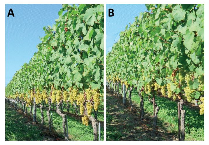
FIGURE 3. Manual (A) versus mechanical (B) pre-flowering leaf removal. Cultivar Doral just before harvest, Nyon, Switzerland. With mechanical LR, lateral shoots were allowed to grow and partially cover the cluster area, while they were completely removed via manual LR.

When compared two-by-two, no difference was observed among Doral wines in terms of sensory analysis, while Gamay wines from mechanical LR tended to be slightly less bitter (-7 %) with smoother tannins (+6 %) than wines from manual LR (both p-values < 0.10).