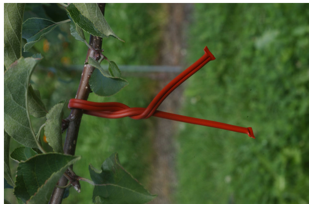
Fig. 6 Principle 4—Pheromone mating disruption is an alternative to chemical control against several lepidopteran pests of fruit