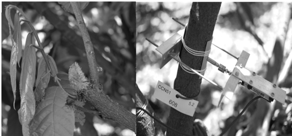
Fig. 1: New flushes after pruning (left) and Dendrometer fixed to the cocoa tree (right)

We monitored the daily stem variation of 15 cocoa trees of the cultivar CCN51 over 6 months in Juazeiro- BA, a semi-arid region of Brazil (BR, Coord. -9.122 -40.258). This region is characterized by average temperatures around 25°C and relative humidities below 50%. Dendrometers (Megatron, Megatron Electronic GmbH & Co.KG Munich, Germany) were fixed on top of the tree bark around the stem and aligned in the north direction (Fig. 1). The Agriscope ( www.agriscope.fr ) online platform was used to gather data every 15 minutes and sent to the Internet via a gateway that was installed on the farm. A meteorological station collected data on air temperature, radiation, air humidity and wind speed. We calculated Evapotranspiration ( ET_0 ) [A198] from this meteorological data. The plants' leaf flushing behaviour was further recorded weekly via direct observation (scoring 0-3, where 0 showed no flushing, and 3 the highest level of flushing).