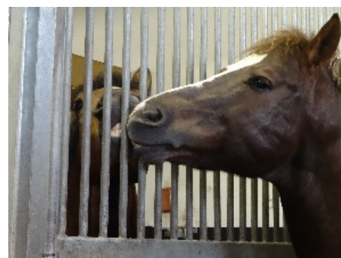
Figure 1. "Conventional box" stabling (CB) allows only restricted tactile contact.