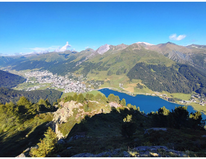
FIGURE 3 Meeting location of the World Biodiversity Forum 2022 in Davos, Switzerland. Left: Local biodiversity of an alpine pasture. Right: Landscape heterogeneity and diversity of ecosystem types.