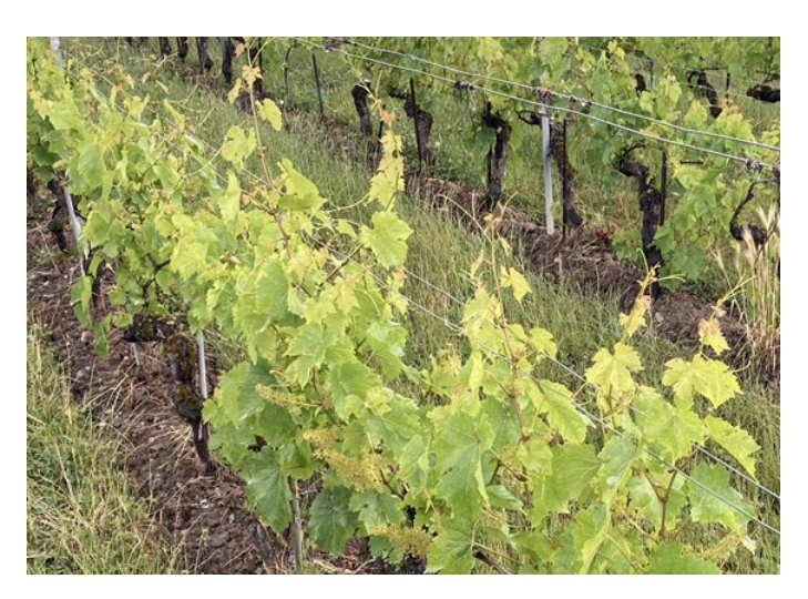
Figure 1. Symptoms of nitrogen deficiency: poor shoot growth and pale green-yellow coloration of the foliage. Phenological stage of flowering, chasselas.

The N-tester and the SPAD 502 are two commercially available chlorophyllmeters that use different scales ( Figure 2 ). Interpretation thresholds are required for the assessment of the nitrogen status of the plant.