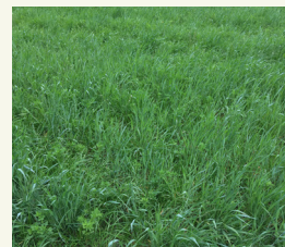
Fig. 1: Grass-legume mixture, can also be used for grazing

A well-studied group of species mixtures are the grass-legume mixtures (fig. 1). Such mixtures result in an excellent root distribution in the soil (fig. 2). Furthermore, mixtures with a proportion of 40-60% legumes can increase the nitrogen fixation by legumes compared to pure legume stands (Nyfeler et al. 2011). Another advantage of grass-legume mixtures is that they can also be used for grazing, which makes them interesting for regions with mixed farming systems, such as field crops and dairy farming. Especially during years with more extreme weather conditions, such "reserve" grassland has a high value.