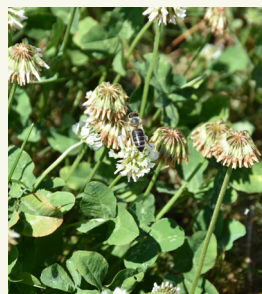
Fig. 3: White clover is an excellent fodder plant for honey bees.

As mentioned above, some cover crops can be used to feed livestock. Another important group of animals that can be fed with cover crops are honey bees and pollinators in general (fig. 3). Most agricultural crops are flowering in spring – early summer. Cover crops are an excellent way to provide bees with pollen and nectar during the summer and fall season. Legumes, cruciferous species, buckwheat and phacelia are excellent plants to feed bees, particularly phacelia (fig. 4) is often grown with the special goal to nourish bees.