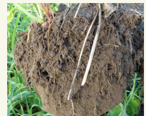
Fig. 2: Root colonization of the soil below a grass-legume mixture.