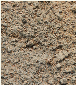
Fig. 3: Pellets of defatted mustard seedmeal before incorporation in the soil.

Another way to apply isothiocyanates to the soil is the use of liquid Brassica seedmeal products (fig. 4). In this case, the seedmeal is manipulated before application. Through this manipulation, the glucosinolates are transformed into isothiocyanates and then dissolved in liquid which is applied to the soil through a drip irrigation system.