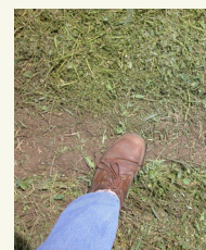
Fig. 1: The finer the mulching degree of the plants, the faster and more isothiocyanates will be released.