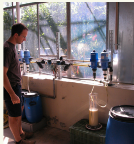
Fig. 4: Defatted mustard seedmeal can be applied to the soil in liquid form, even after planting the crop.