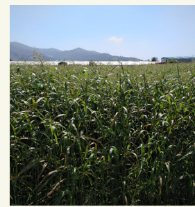
Fig. 6: Sudangrass in summer (> 35°C) in Southern Spain.

Additional information on biofumigation are published as an EIP-AGRI minipaper: