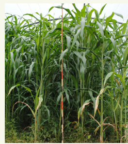
Fig. 5: Sorghum-sudangrass 8 weeks after sowing under tunnel.

The term 'biofumigation' was originally defined as the process of growing, macerating / incorporating certain Brassica or related species into the soil, leading to the release of isothiocyanates through the hydrolysis of glucosinolates contained in the plant tissues (Kirkegaard et al., 1993). But sorghum ( Sorghum bicolor ) and sorghum-sudangrass ( S. bicolor x S. sudanense ) cultivars with high content of dhurrin, a substance which is transformed in toxic hydrogen cyanide (also called prussic acid) are also plants that can be used for biofumigation (de Nicola et al., 2011). Both species are well adapted for growth under high temperature conditions, such as those which occur under protection in summer (fig. 5). Therefore, they are well suited to the southern regions of Europe (fig. 6). Another advantage is that they are grass species, which makes them especially suitable to be part of crop rotations in vegetable production systems.