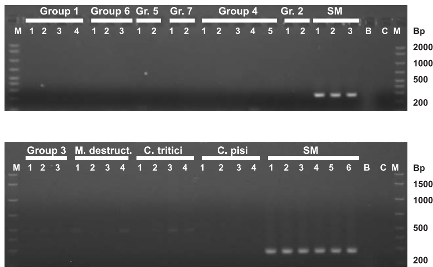
FIGURE 2. Result of nested PCR amplification specific for Contarinia nasturtii . Successful amplification occurs only with C. nasturtii DNA as template. Numbers indicate different individuals belonging to each of the species groups (as suggested by the phylogenetic analysis; see Figure 1). B, blank; C, negative control reaction; M, size marker; Bp, base pairs.

specimens. The assay is currently being used to optimize the species-specificity of a synthetic SM pheromone that is under development in a European collaborative project.