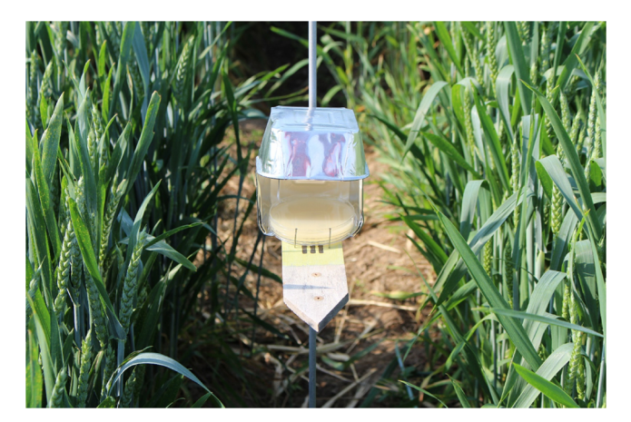
Fig. 2. Spore traps with Fusarium selective medium placed between two adjacent wheat varieties and adjusted to the same height as the flowering heads.

mustard (Mulch WM; Sinapis alba , Admiral; Feldsaaten Freudenberger, Germany), Indian mustard (Mulch IM; Brassica juncea , Vittasso; KWS, Germany) or berseem clover (Mulch Cl; Trifolium alexandrinum , Tabor; Jouffray-Drillaud, France). Cover crops were sown in mid-August in a neighbouring field at a rate of 20 kg ha<sup>-1</sup>, 8 kg ha<sup>-1</sup> and 30 kg ha<sup>-1</sup>, respectively. After approximately three months (WM and Cl: anthesis; IM: vegetative stage), the aboveground biomass of the plants was collected, cut in 4–6 cm pieces with a sample chopper (Wintersteiger Hege 44, Austria) and 17 kg fresh biomass (equalling to 18.9 t ha<sup>-1</sup>) was manually applied to each subplot, providing sufficient coverage of the inoculated maize stalks. The rationale behind this rate was to apply the same aboveground biomass that can usually be produced in the region of the study by the mustard crops. The same application rate was used for berseem clover to allow comparisons among the mulch layer treatments