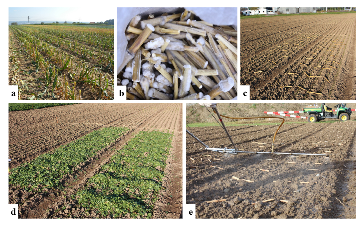
Fig. 1. Experimental set-up of the study: (a) maize field after harvest where stalks were collected, (b) inoculated maize stalk pieces with Fusarium graminearum conidial suspensions after incubation, (c) inoculated maize stalks on the soil surface of wheat plots after incubation, (d) applied mulch layers, (e) spraying application of botanicals.