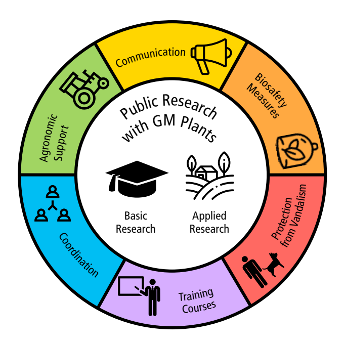
Fig. 1 | Services provided by Agroscope as operator of the Protected Site.

In 2005 the Swiss electorate approved a five-year moratorium on the commercial cultivation of GM plants. Since then, the moratorium has been extended by the Swiss Parliament another three times, latterly until the end of 2021. In November 2020, the Federal Council proposed extending the moratorium by a further four years. Research, including field trials, is explicitly excluded from this moratorium, among others to allow the advantages and disadvantages of GM plants to be explored and in order to ensure freedom of research in Switzerland in the field of plant sciences.