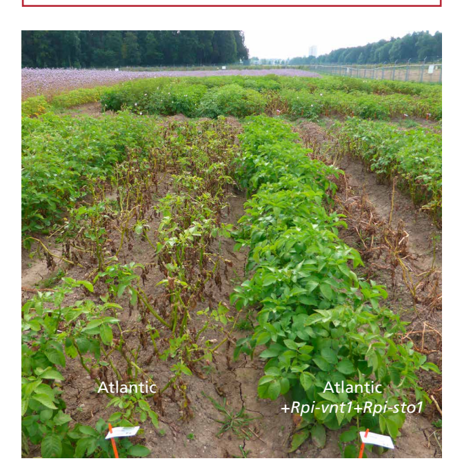
Fig. 3 | Field trial with cisgenic potato plants on the Protected Site. Fungicide treatments were forgone for the entire trial. Left of centre in the photo is a row of the variety 'Atlantic' heavily infected with late blight. To the right of this there is a row with cisgenic Atlantic which is completely resistant thanks to its two resistance genes from wild potatoes, Rpi-vnt1 and Rpi-sto1 .

From 2015 to 2019, a field trial with cisgenic<sup>1</sup> potatoes was conducted on the Protected Site. The cisgenic potatoes carry up to three resistance genes from wild potato species against the potato late blight pathogen (Phytophthora infestans). A combination of several resistance genes conferred complete resistance throughout all the years of the trial, confirming the results of similar field trials in The Netherlands and Belgium (Haesaert et al., 2015; Haverkort et al., 2016). Whereas Swiss commercial potato crops require 7-8 plant-protection treatments on average to protect them from the aggressive potato late blight pathogen (SCNAT, 2018), the cisgenic lines showed no disease symptoms whatever in these trials, even without plant protection (Fig. 3). Since a combination of several resistance genes is difficult for the pathogen to overcome, these plants could be grown without the application of plant-protection products, thus simultaneously massively reducing yield losses and plant-protection product use in potato production.